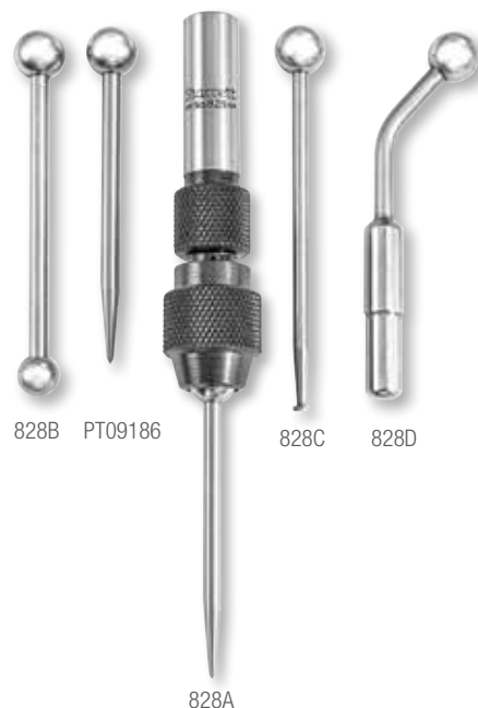
Complete set with case includes: 828B Ball Contact, 828A Wiggle/Center Finder with pointed shank, 828C Disc Contact, and 828D Offset Indicator Holder

Offset Indicator Holder 828D with the Last Word® Test Indicators, the user can sweep holes or O.D.s for checking run-out or concentricity, establish center distances, check straightness or alignment of flat surfaces.